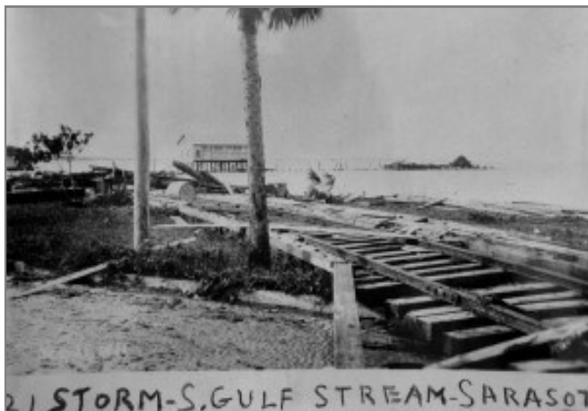
Gulfstream Avenue at the foot of Main Street after the October 1921 hurricane.

Sign up for the NPM Coalition and join the 2,000+ existing members. Members agree to promote emergency preparedness in their home, workplace or community and receive access to preparedness resources and events. www.community.fema.gov .